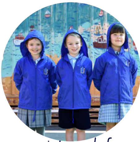
a special coat for rainy days