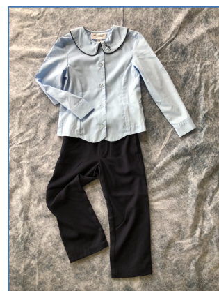
Blouse & Navy Pants K-6

YEARS 4-6 PSSA SOCKS - Purchase via Spriggy or at the Uniform Shop.