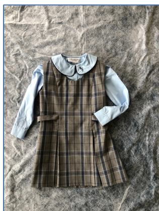
Junior Plaid Dress K-2

WINTER UNIFORMS - It's time to get your Winter Uniforms! Via Spriggy or in person at the Uniform Shop.