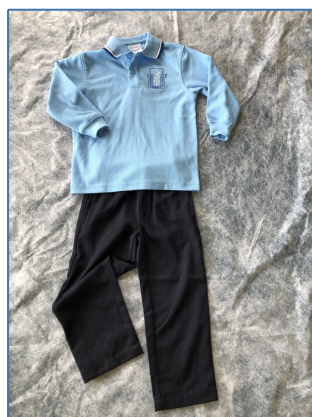
Long Polo Shirt & Navy Pants K-6