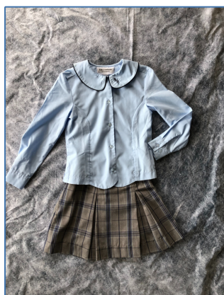
Senior Plaid Skirt Yrs 3-6