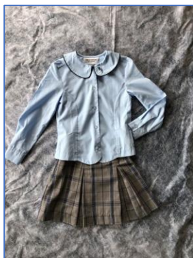
3-6 Plaid Skirt and Blouse, Navy Socks and Black Shoes.