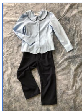
K-6 Pants and Blouse, Navy Socks and Black Shoes.