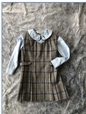
K-2 Plaid Dress and Blouse, Navy Socks and Black Shoes.

Make sure you have your Winter Uniform items ready to return to school in Term 2.