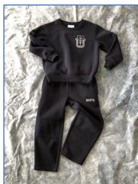
K-6 Winter Sport