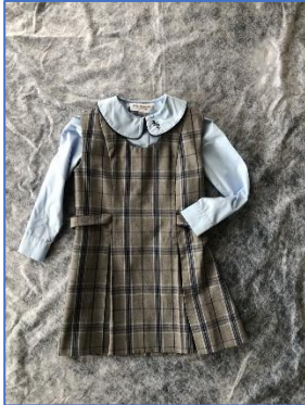
K-2 Plaid Dress and Blouse, Navy Socks and Black Shoes.

It's time to check your Winter Uniforms ready for Term 2