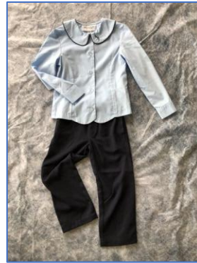
K-6 Pants and Blouse, Navy Socks and Black Shoes.