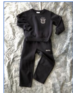
K-6 Winter Sport

Please remember items will only be returned or exchanged within 28 days of purchase!!! Folded in original packaging with inclusions eg: clips etc ( not ripped open ). Tags attached with a receipt. Refunds are only available in store at the Uniform Shop No returns or exchanges on hats, hair accessories, socks & hosiery or second hand items. NSW Vouchers - Item sizes may be exchanged but there are No returns.