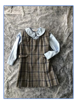
K-2 Plaid Dress and Blouse, Navy Socks and Black Shoes.