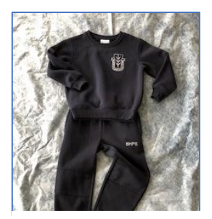
K-6 Winter Sport