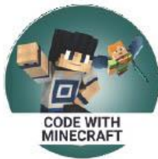
CODE WITH MINECRAFT

JOIN US FOR EXCITING NEW CAMPS THIS HOLIDAYS!