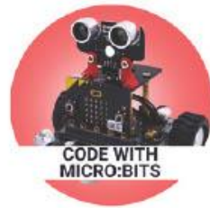
CODE WITH MICRO:BITS