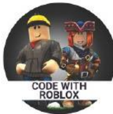
CODE WITH ROBLOX