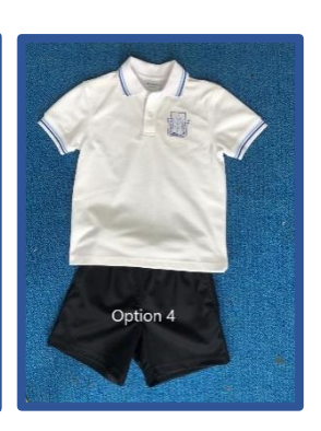
Available next Summer 2022 | 2023