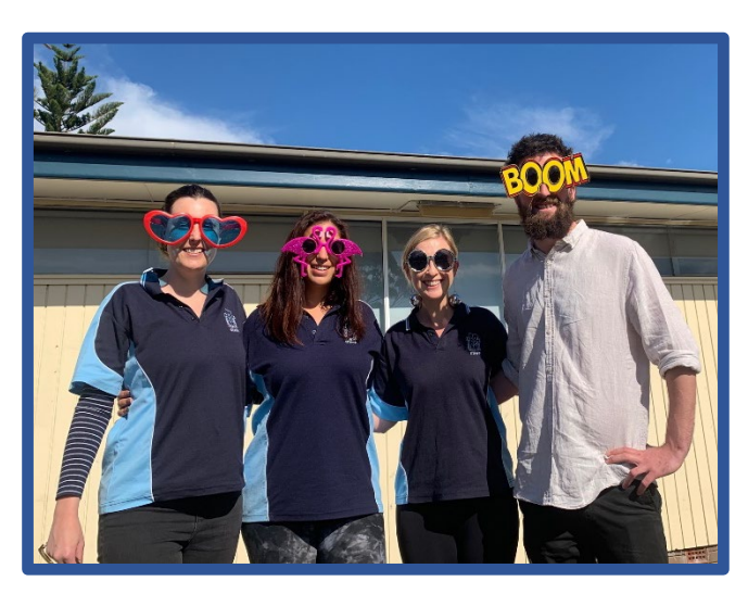
Teachers celebrating World Teachers' Day - 'A Bright Future'