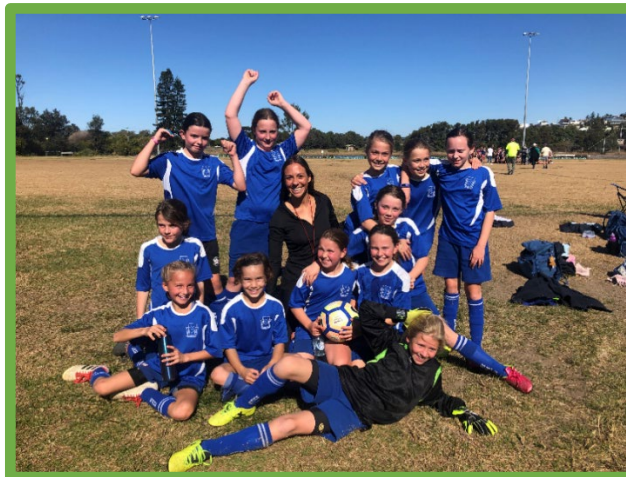
Junior A Girls Soccer