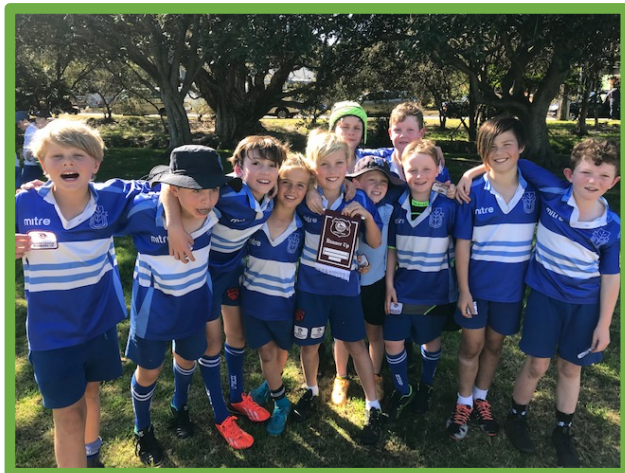
Junior Boys Rugby League