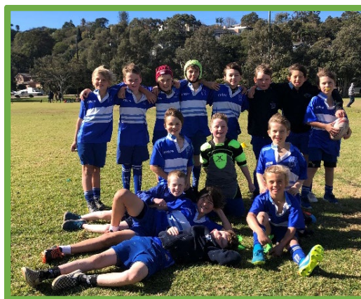
Junior Rugby League Semi Final win 7/8/19