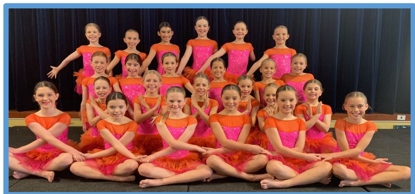
Junior Dance Group