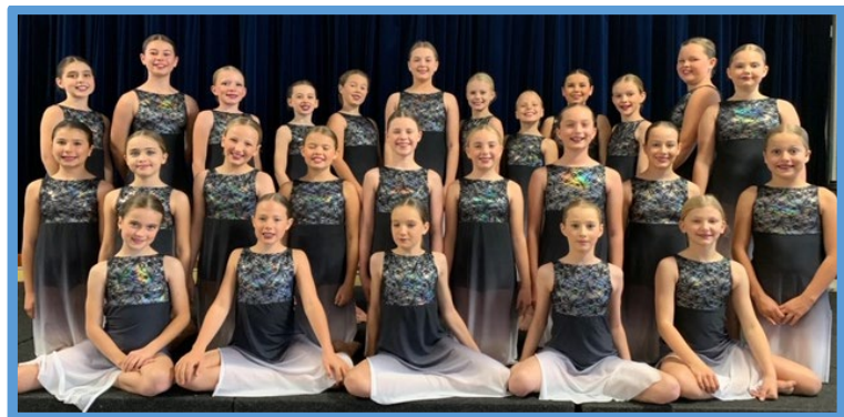
Senior Dance Group