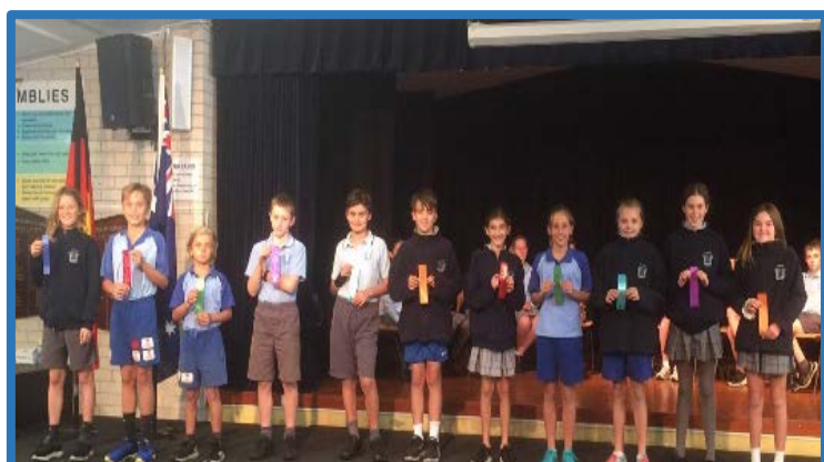
Years 11 Cross Country