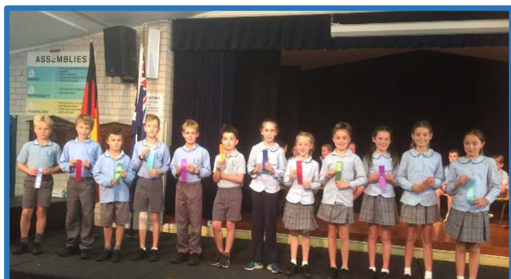
Years 8/9 Cross Country

Congratulations to our placegetters in our school Cross Country.