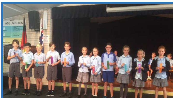
Years 10 Cross Country