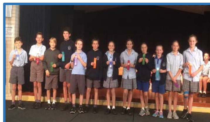
Years 12/13 Cross Country