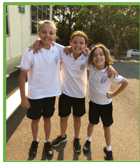
BHPS Girls Navy Shorts