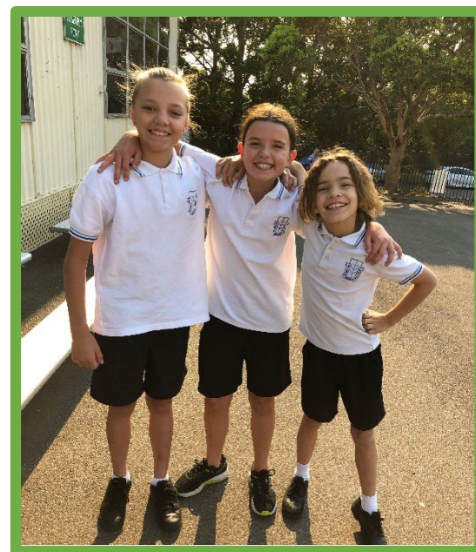
BHPS Girls Navy Shorts